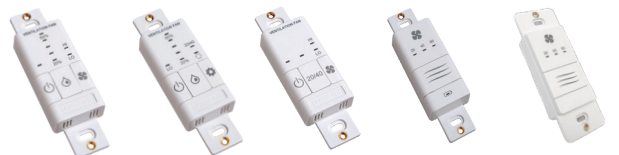
99-GBC02 99-GBC03 99-GBC04 99-DET02 99-DET01

Extends range of 99-DET02 Wireless Timers. Plugs into 120V power outlet. Wirelessly connects to main control and 99-DET02. Install at halfway point between timer and main wall control if timer is out of range.