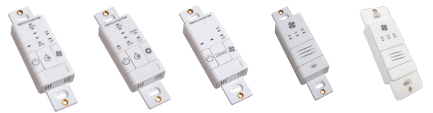
99-GBC02 99-GBC03 99-GBC04 99-DET02 99-DET01

Extends range of 99-DET02 Wireless Timers. Plugs into 120 V power outlet. Wirelessly connects to main control and 99-DET02. Install at halfway point between timer and main wall control if timer is out of range.